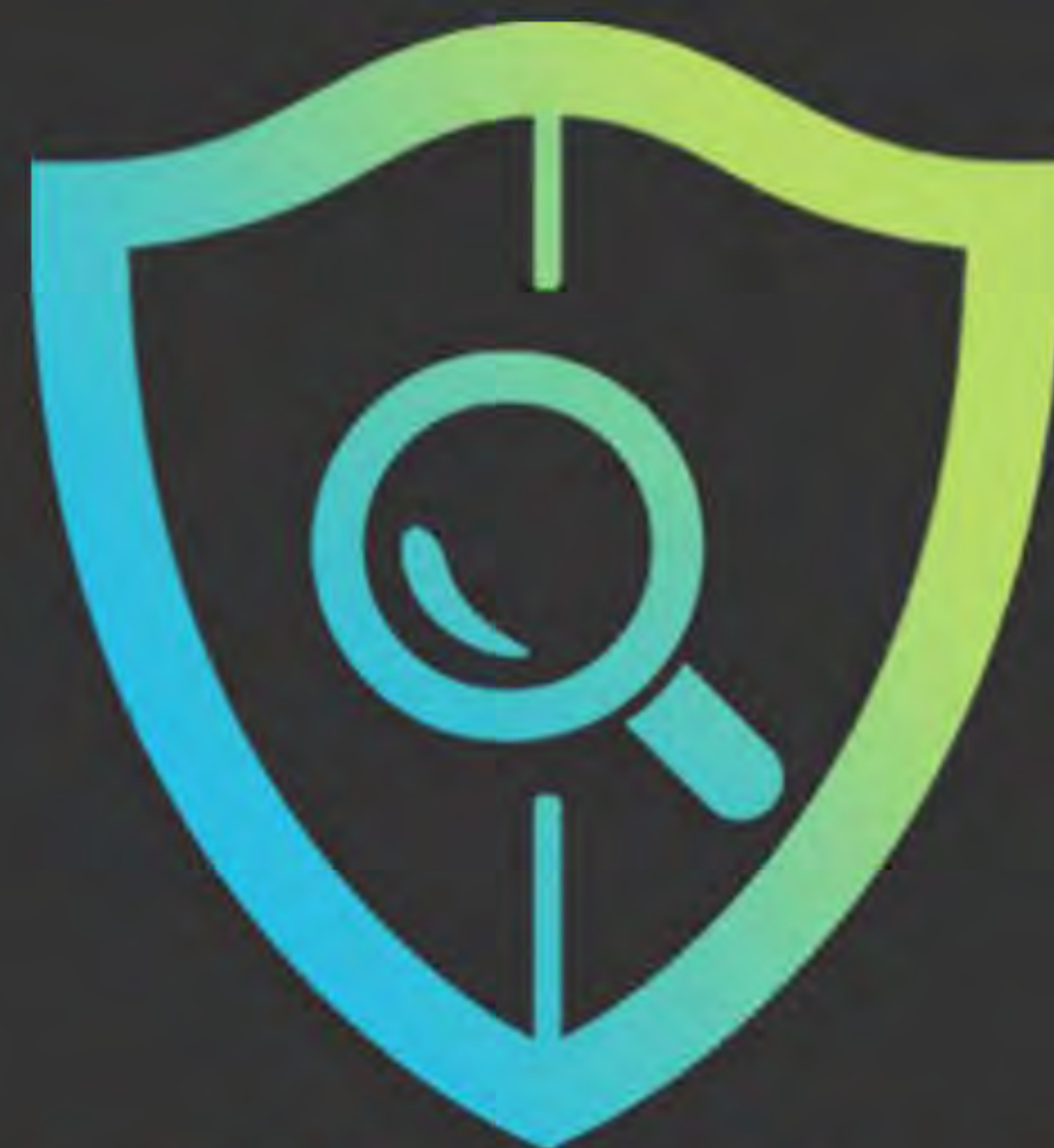
DETECTION & RESPONSE